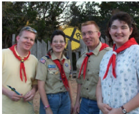
Some of the leaders of Pack 206, Bowie Elementary

that "Akela's Wonderland extends the knowledge and skills gained in Akela's Kiva. Students learned more of the "how-to's" involved in running a successful den, Webelos patrol and pack."